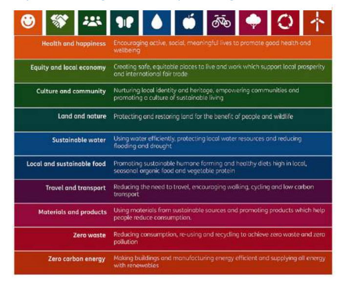
Figure 1 One Planet Living Principles http://www.bioregional.com/oneplanetliving/

leaving space for wildlife and wilderness".<sup>3</sup> One-Planet Living uses ecological and carbon foot-printing as its headline indicators. It is based on ten guiding principles of sustainability as a framework, (see Figure 1). Currently, 4.5 million people live in cities and city-regions that will be participating in the new One Planet Cities project, funded by the KR Foundation.<sup>4</sup>