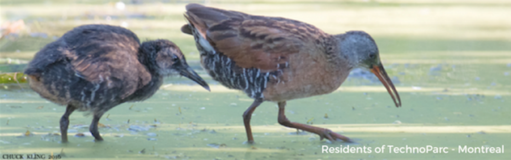
Residents of TechnoParc - Montreal